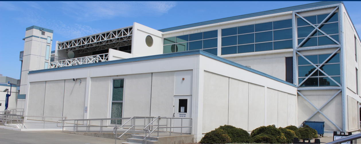
Social Science 1960s