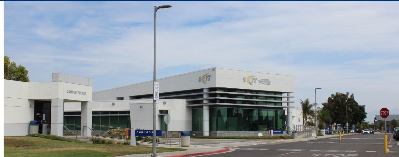
Auto Partners 2010s