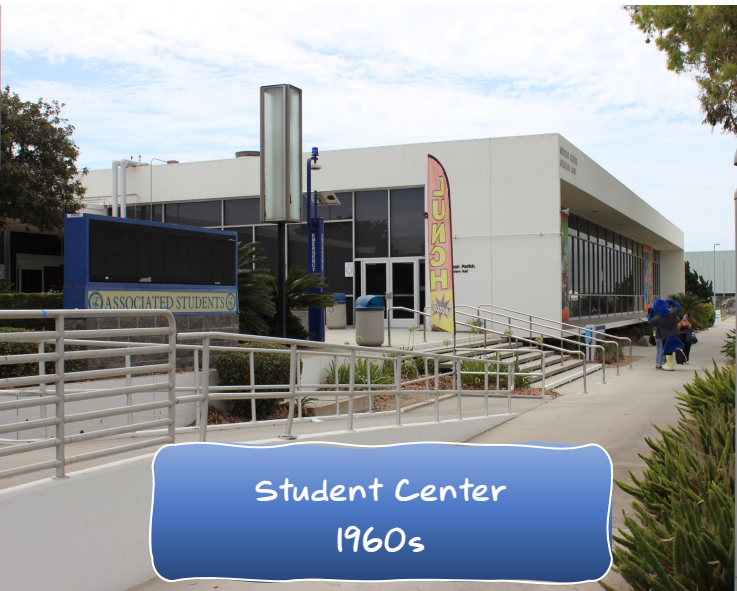
Student Center 1960s