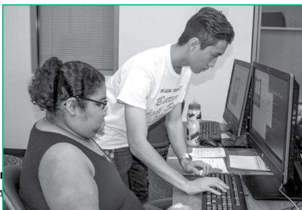
Student Accessibility Services is located in the Liberal Arts/SAS Building.

DANC 102 - Introduction to Adaptive Dance - 2.0 units