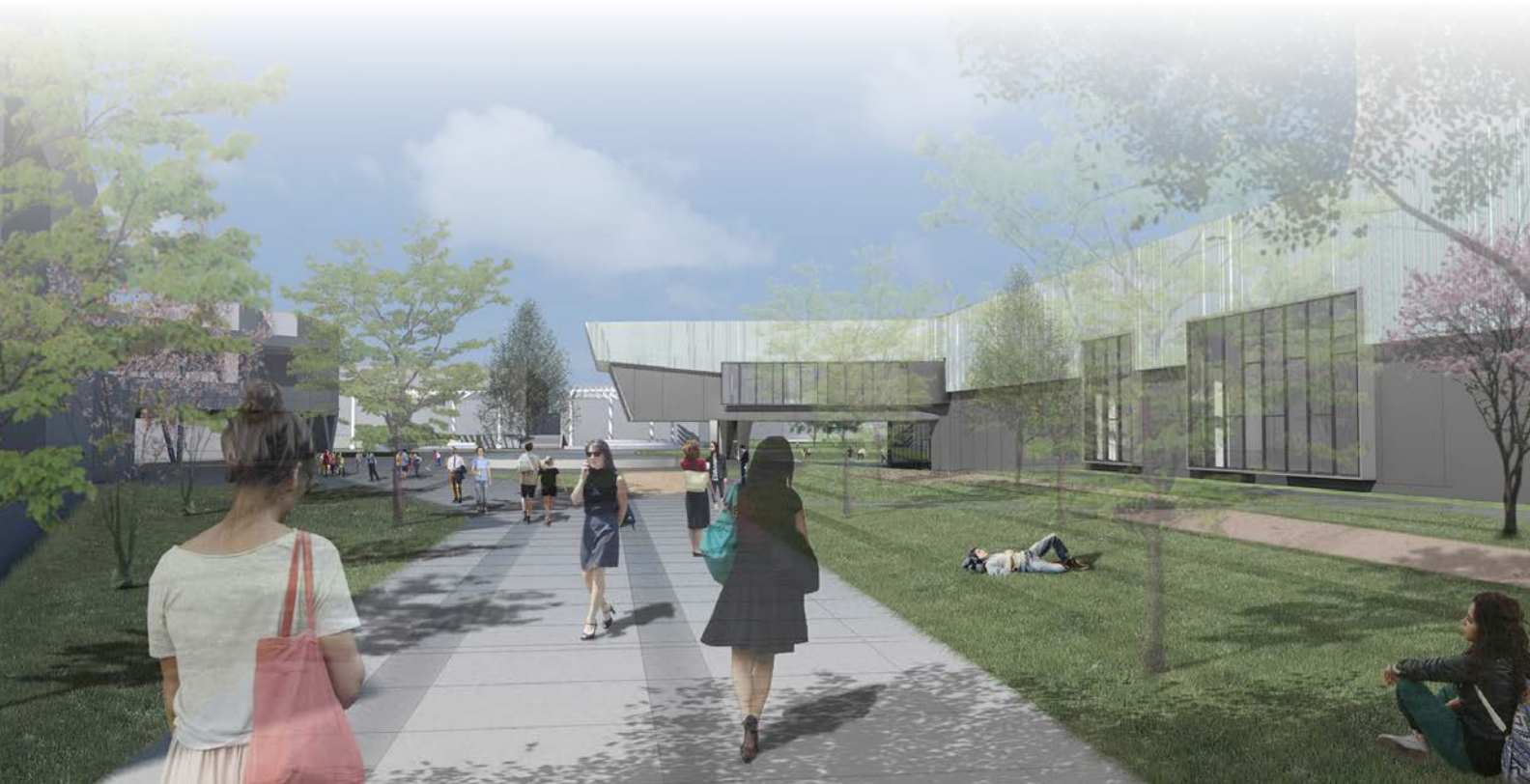
Performing Arts Center rendering

Thanks to voter-approved funds from Measure CC (2004) and Measure G (2012), the College continues its transformation to upgrade the campus with modern facilities and resources. The College is committed to developing the best student-learning environment featuring energy efficient and sustainable designs.