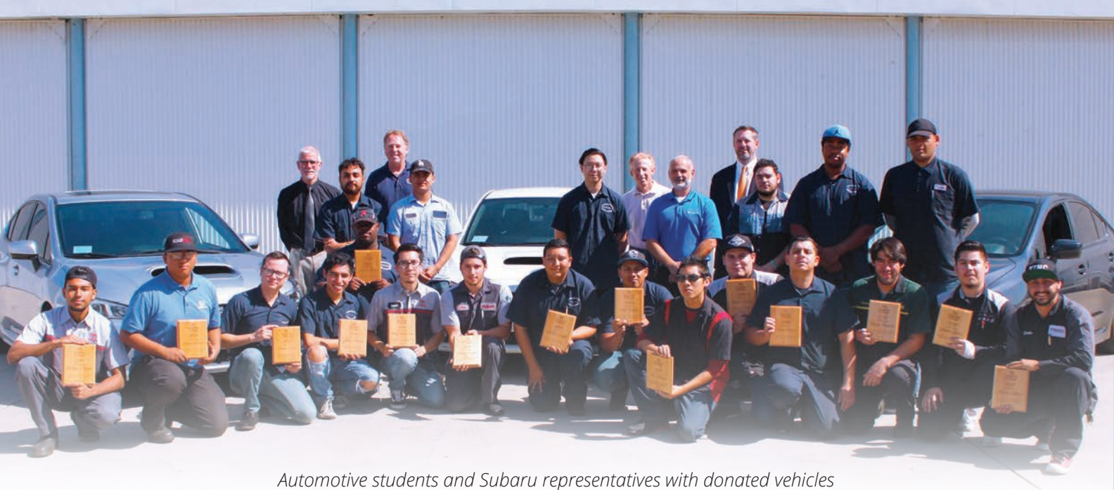
Automotive students and Subaru representatives with donated vehicles