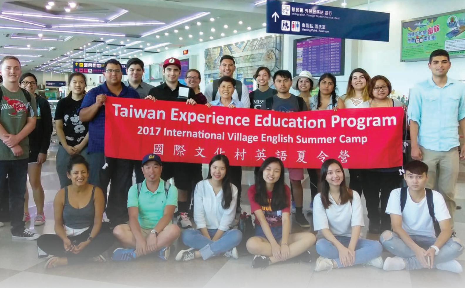
2017 Taiwan Experience Education Program participants