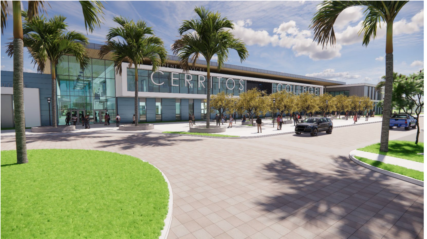
Student Services/Administration Building (SS/A) Concept Drawing August 2022

2021-22 | ANNUAL REPORT Cerritos Community College District Citizens' Bond Oversight Committee