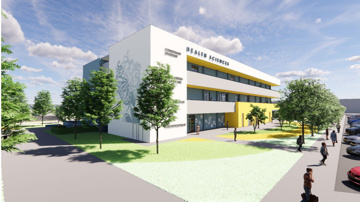
Health Sciences Modernization 2022-2023