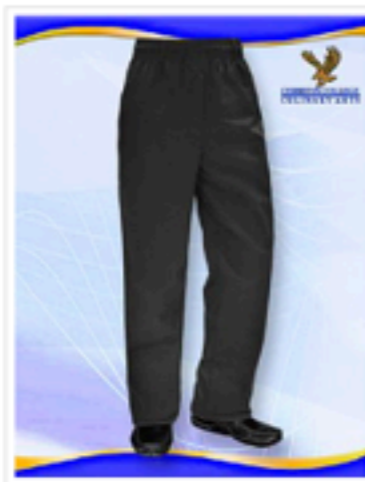
Cerritos Elastic Waist Pants Price $18.50