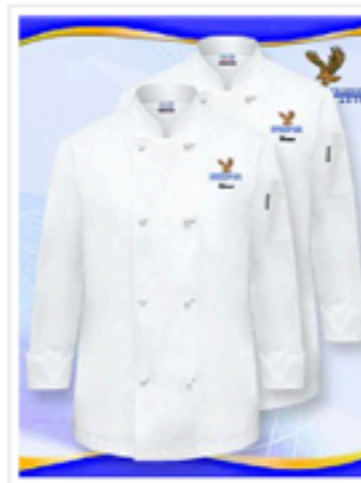
Cerritos Chef Coat Buy 2 or More at $21.95 Each Price $21.95