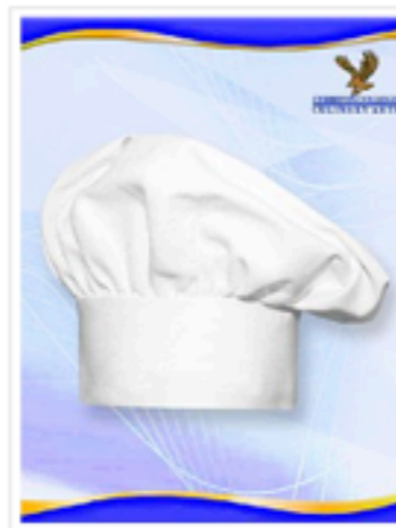
Cerritos Floppy Hat Price $4.50