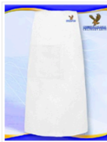
Cerritos Bistro Apron Price $11.50