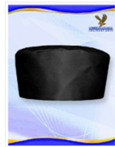
Cerritos Skull Cap Price $4.50