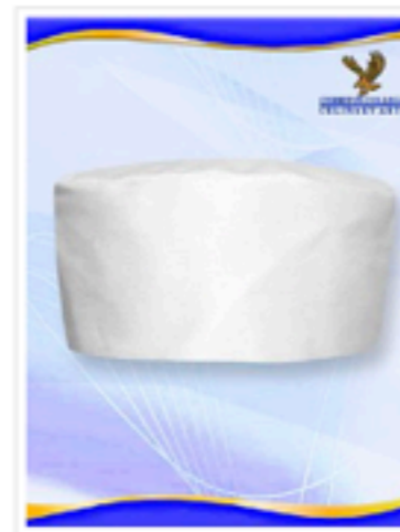
Cerritos Skull Cap Price $4.50