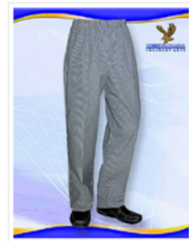
Cerritos Elastic Waist Pants Price $16.50