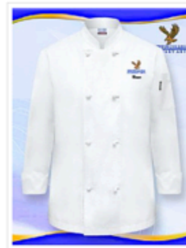
Cerritos Chef Coat Price $23.95