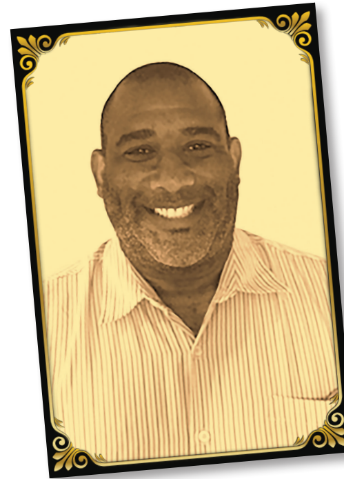
Distinguished Male Athlete Basketball