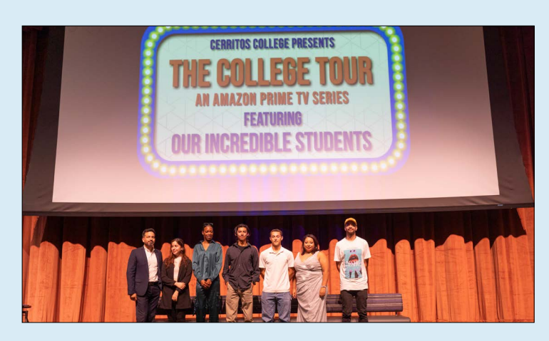
The College Tour Cerritos College edition debuted on Amazon Prime; Blue Carpet Premiere featured student stars

Artesia, Bellflower, Cerritos, Downey, Lakewood, La Mirada, Norwalk, Paramount, Santa Fe Springs, and South Gate