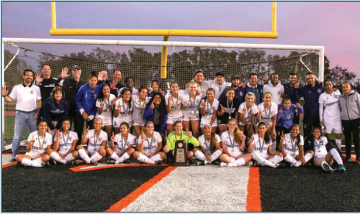
Women's soccer team wins fifth straight CCCAA State Championship and named NSCAA National Champions for fifth time