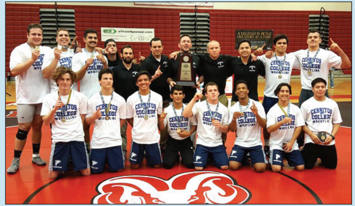
Wrestling team captures CCCAA Team Dual State Championship