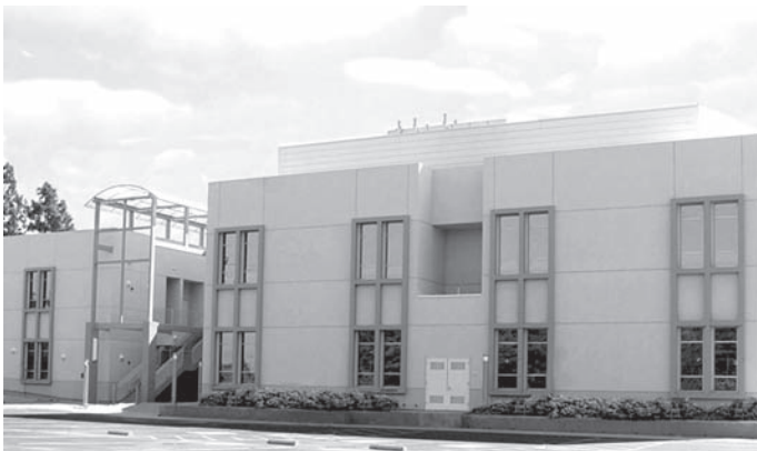
New Science Building