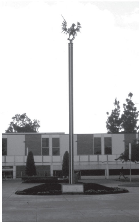
Original Falcon Square