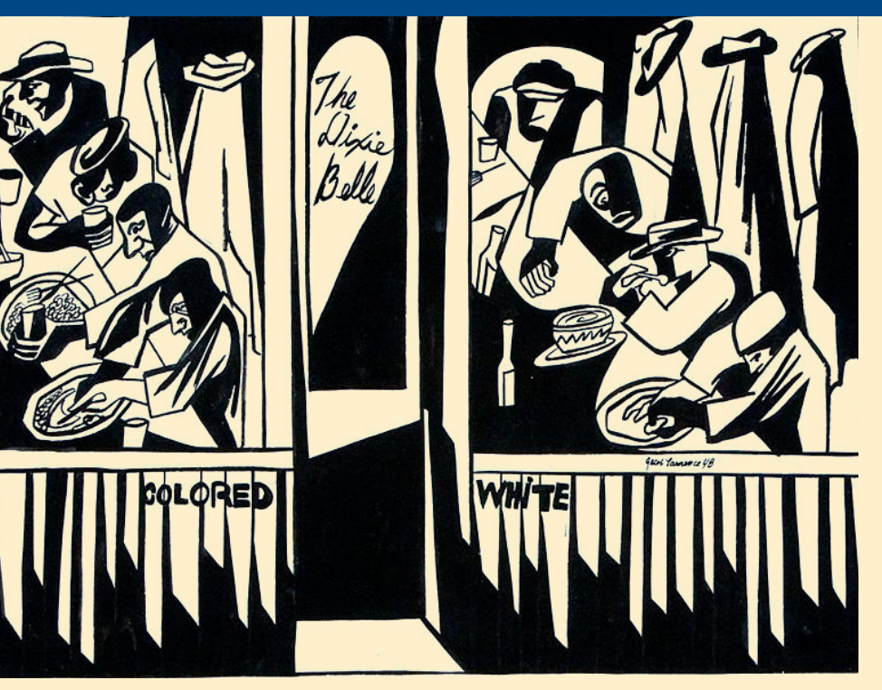
© Jacob Lawrence (1917–2000), Dixie Café, 1948, ink on paper, 17 x 22 1/4 in., National Museum of African American History and Culture