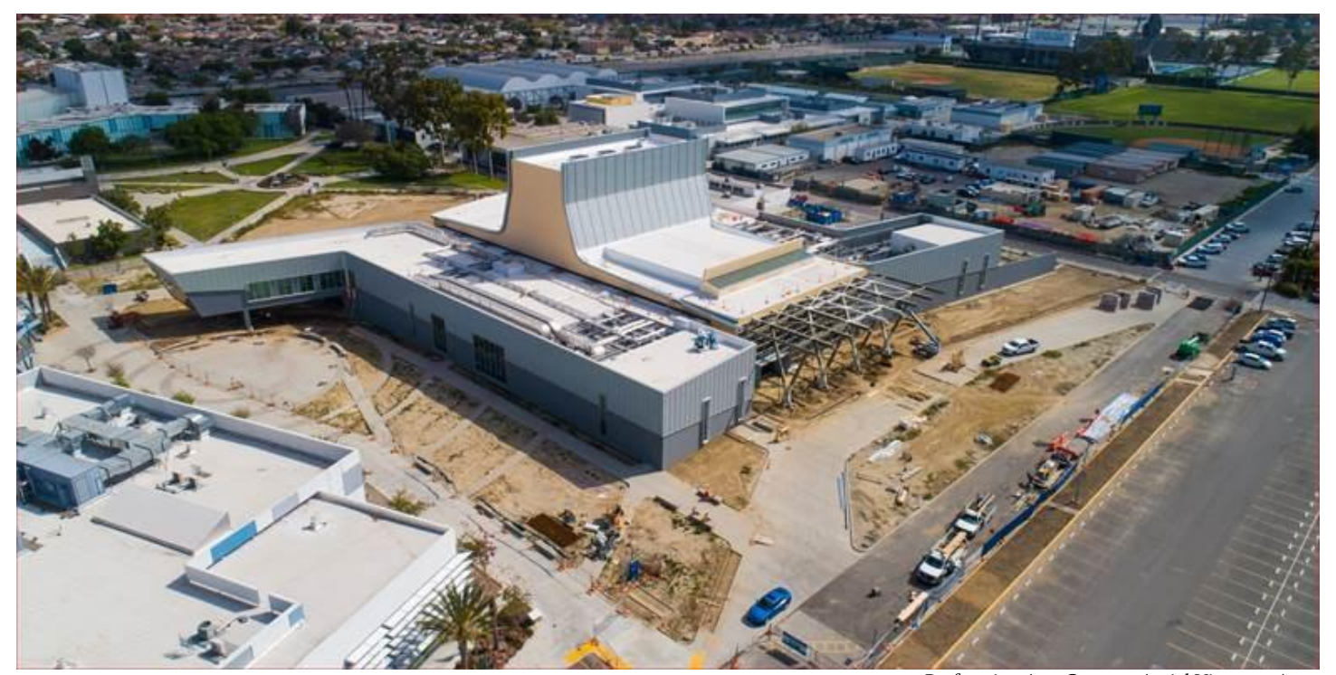
Performing Arts Center - Aerial View - 04/2021

2019-20 | ANNUAL REPORT Cerritos Community College District Citizens' Bond Oversight Committee