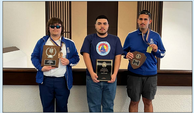
The forensics team won gold and silver at the Phi Rho Pi national championships