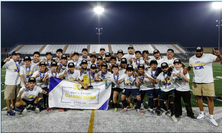
The men's soccer team was named United Soccer Coaches National Champions