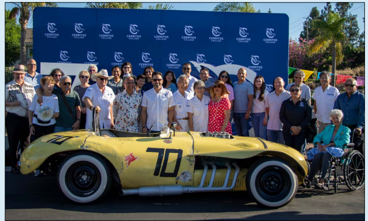
The college celebrated 70 years of excellence with the Rev'd Up Since '55 community car show