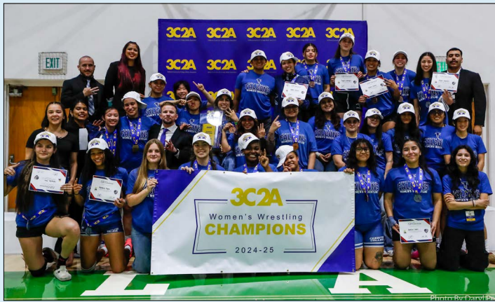
The women's wrestling team secured third straight 3C2A championship