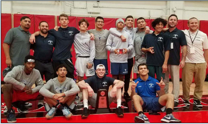
Falcon wrestling won the 2019 SoCal Regional Championship