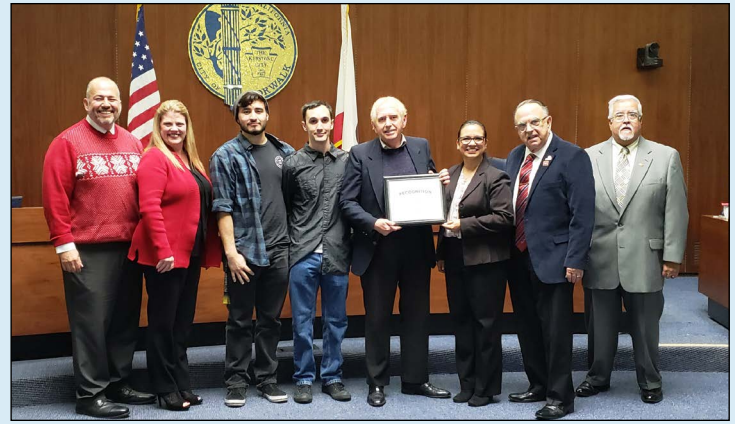
WPMD radio station named the Best Two-year College Radio Station by the College Media Association