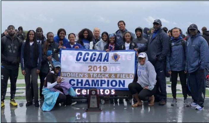
Women's track & field team wins ninth state championship