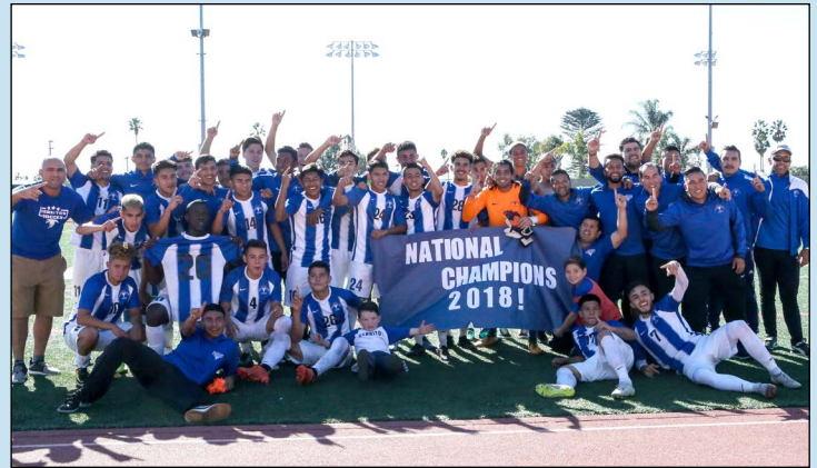
Men's soccer team earned its first national championship