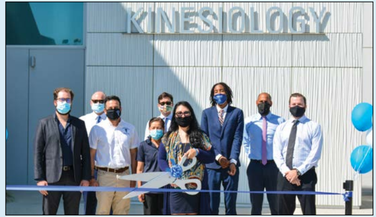
Health & Wellness Complex Grand Opening