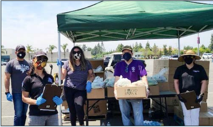
L.A. Regional Food Bank food drives on campus have served more than 20,000 students and families