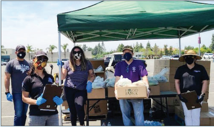
L.A. Regional Food Bank food drives on campus have served more than 20,000 students and families