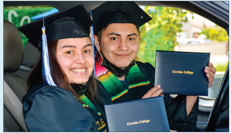
College celebrates the Class of 2021 with drive-thru and online ceremonies