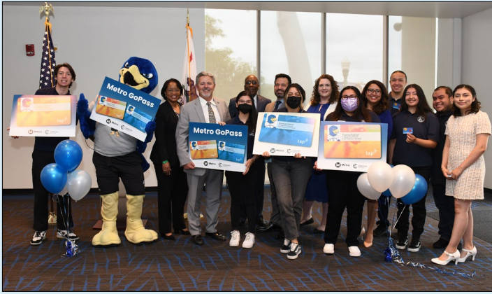
New Metro GoPass program launched in March 2022