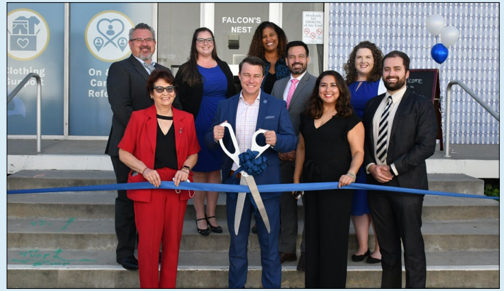
Cerritos College celebrated the grand opening of Falcon's Nest in March 2022