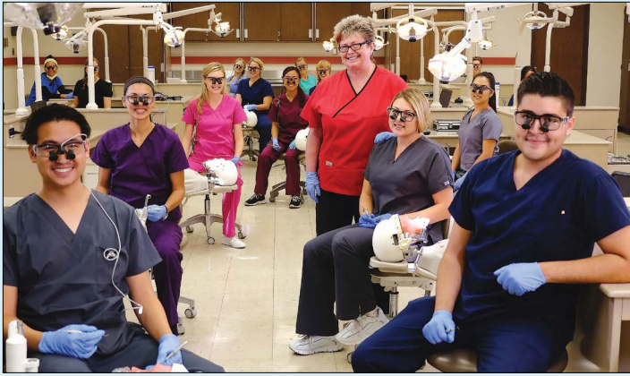
Cerritos College was approved to offer a Bachelor of Science program in Dental Hygiene