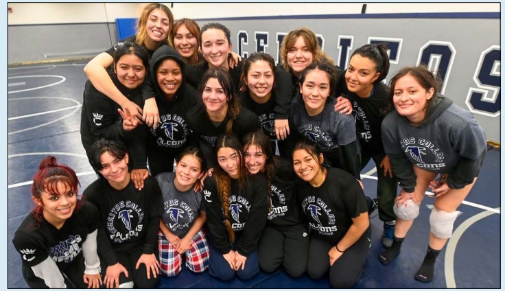
Falcon women's wrestling team wins inaugural CCCAA State Championship