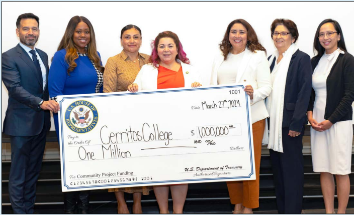
Congresswoman Linda Sánchez presented $1 million to expand the Child Development Center