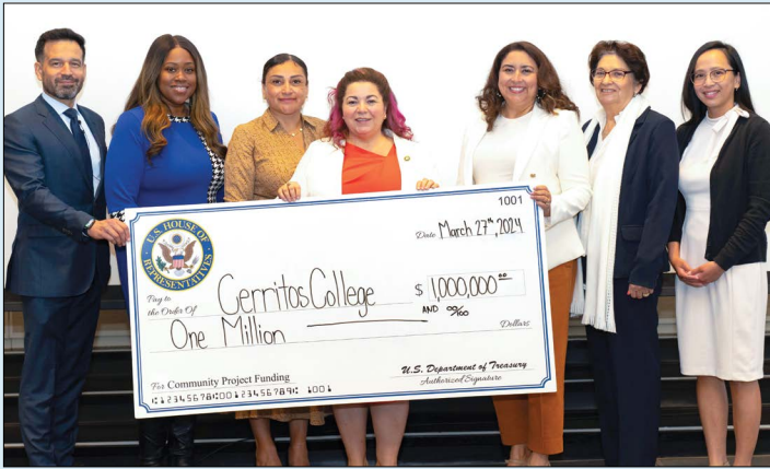
Congresswoman Linda Sánchez presented $1 million to expand the Child Development Center