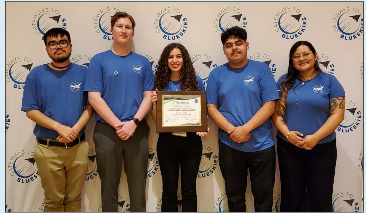
Cerritos College students win the Future Game-Changer Award at NASA's 2024 Gateways to Blue Skies Competition