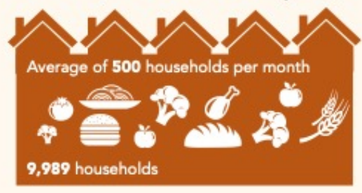
Pre-COVID (December 2017-February 2020)

Since Fall 2017 a total of 21,259 households have been served